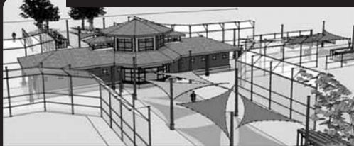
Concession Building 1